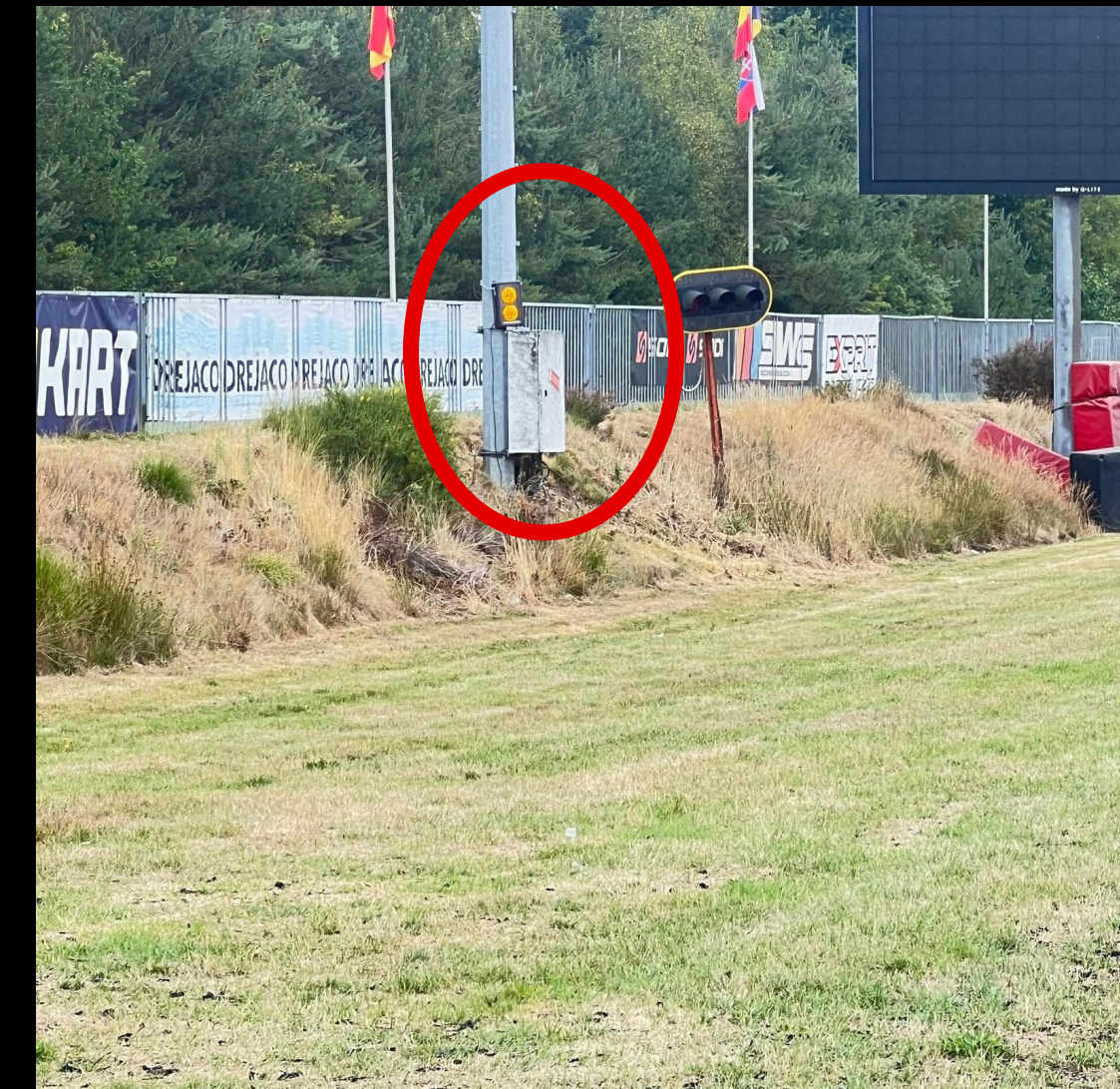
Orange Flashing Light REPEATER