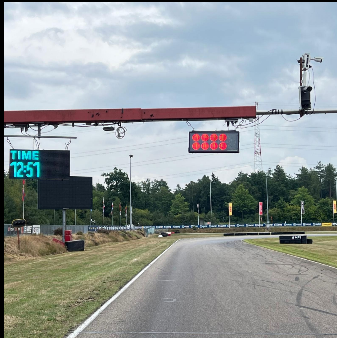
Picture of RED lights ON

RED lights & Orange flashing light are ON. One extra formation lap.