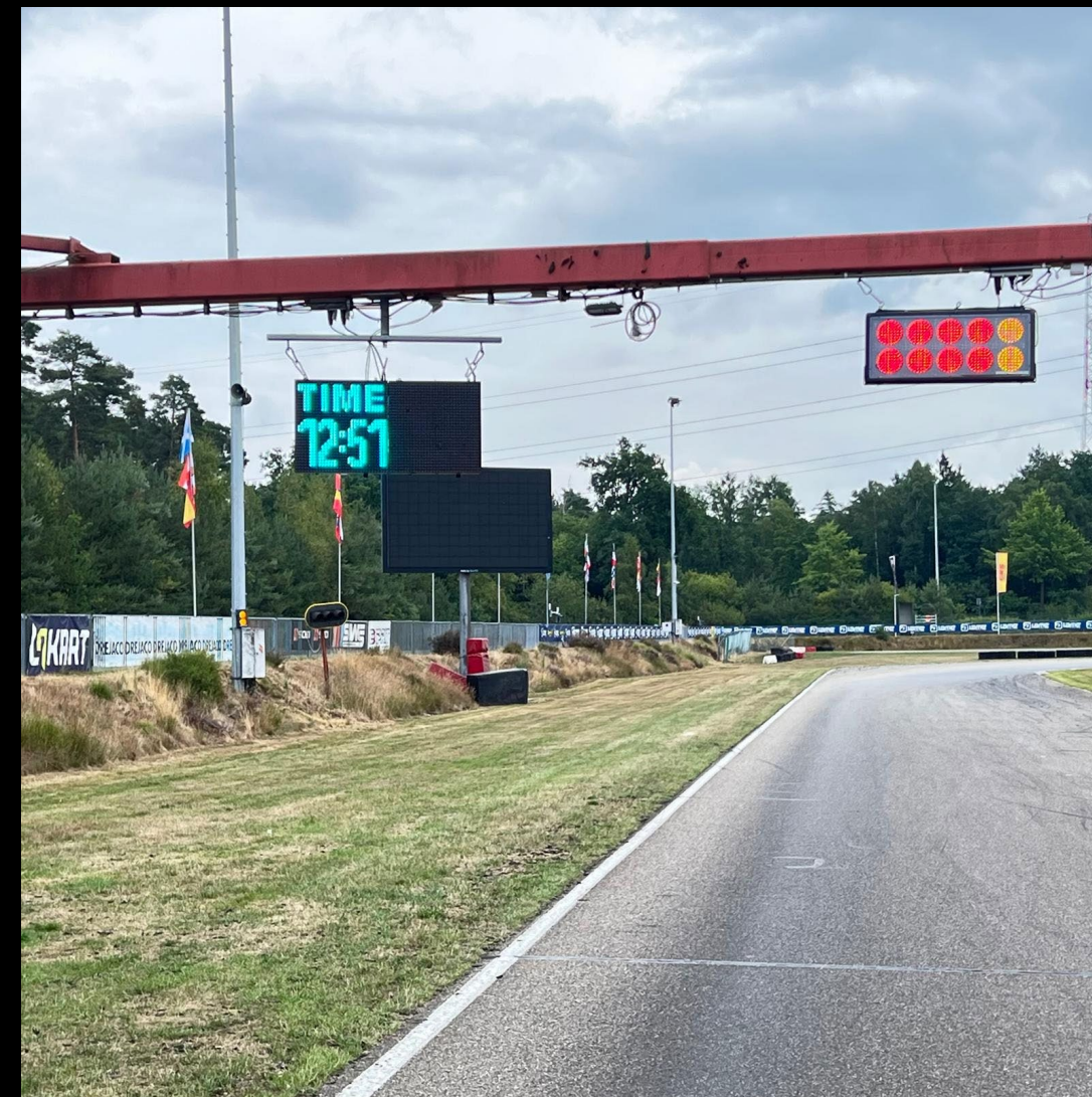
Orange Flashing Light